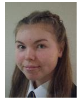
Deputy Head Girl