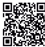
The Radcliffe School's DofE Website