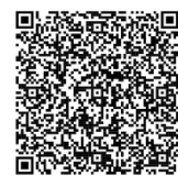
DofE Activity Ideas