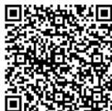
DofE Enrolment Form (To be completed by Parent/Carer)